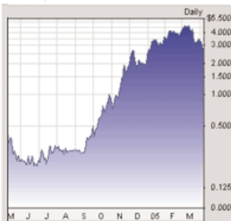
TASKER PRODUCTS CORP as of 4/5/2005

Subsequent financing of $15 million from additional investors led to the acquisition of Pharlo Citrus Technologies, an R&D company with disruptive chemical technologies. In 2005 TKER reached a 52-week high of $4.92 with a $300 million market capitalization. Average volume had peaked to over a million shares a day. The key drivers for the investment were based on the company's intellectual property portfolio, which at the time were pending USDA approval.