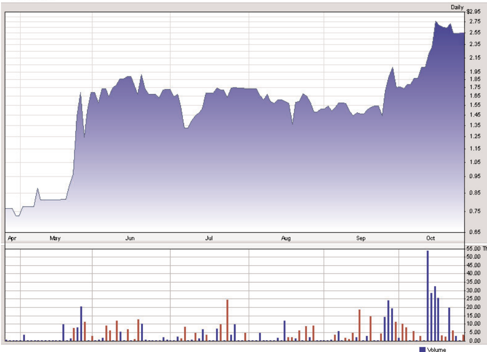
ALTER NRG CORP as of 10/27/2009

Alter NRG Corporation is a Canadian-listed company on the TSX and cross-listed on the OTCQX. The company had gone public in 2007 and enjoyed a strong balance sheet, great management team and proprietary technology.